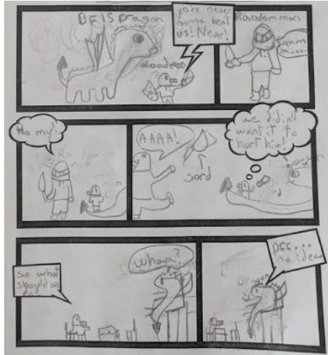
(Lara, 3rd grade)